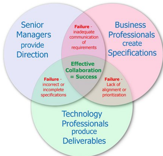
The Project Triad

Each participant will also receive an information packet, with reference cards to serve as a reminder of the PPE concepts.